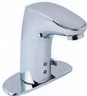
OBSOLETE MODEL SYMMONS S-6080