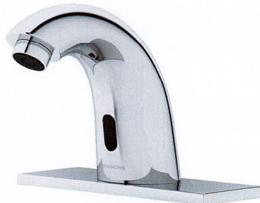
REPLACEMENT MODEL SYMMONS S6960B